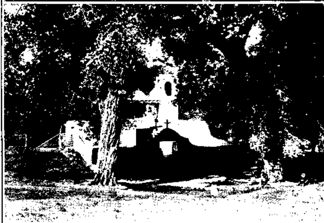
Frijoles Canyon in Bandelier National Monument—New Mexico Sanctuario, the Lourdes of New Mexico

cliffs. Others are built in natural open caves formed by weather erosion; many have fronts of masonry and doorways with timber casings.